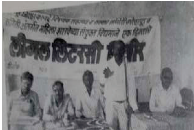
Legal Literacy Campaign, 1992