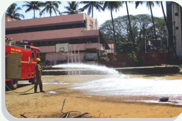
Demo by Department of Fire in College Premises