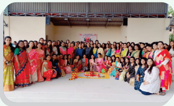
Hadga Celebrations, 2022