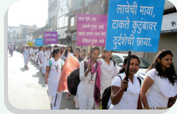
Legal Awareness Rally