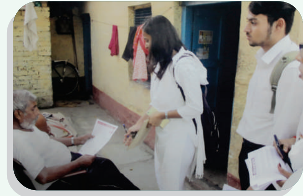
Spreading Legal Awareness amongst Locals