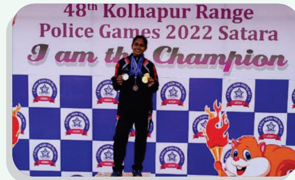
Weightlifting Championship Medalist