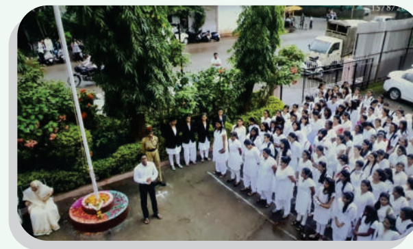
Republic Day Celebration 2019