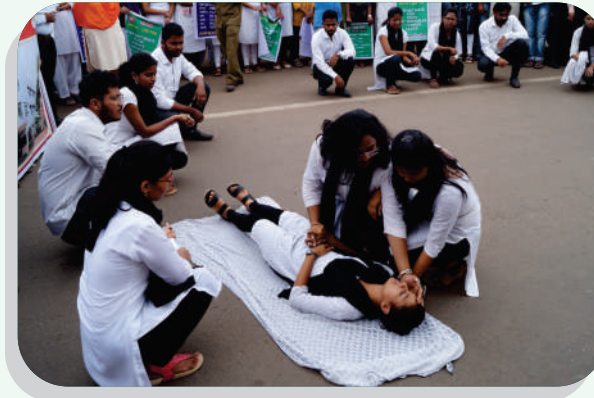
Legal Awareness Street Play