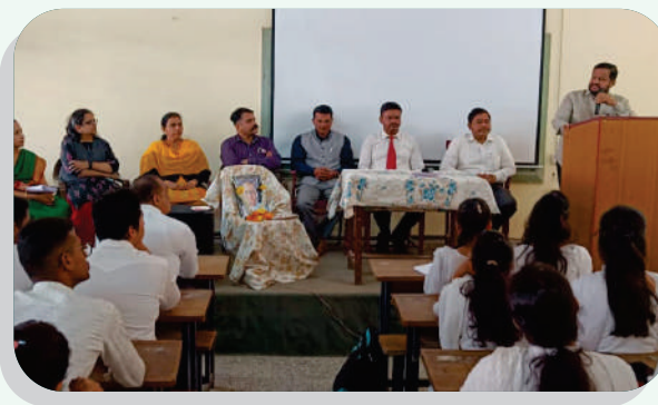
Sardar Vallabhbhai Patel Jayanti, 2022