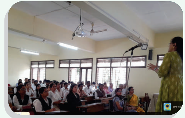
IPR Lead College Activity