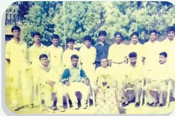
Cricket Trophy, 1999-2000