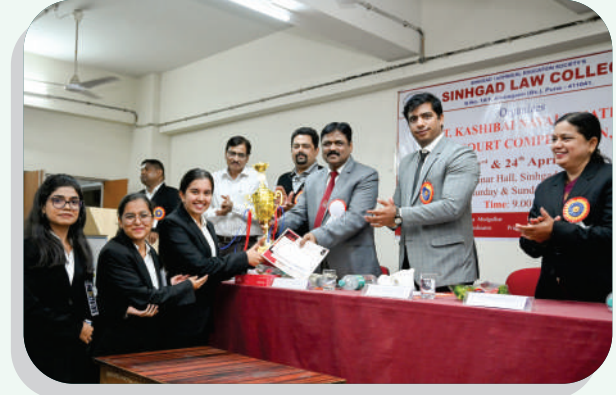
SLC Winners of 2022 Kashibai Navale 8th National Moot Court Competition