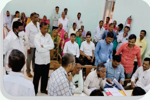
Participation of SLC Students in Lok Adalat