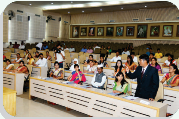
Youth Parliament, 2016