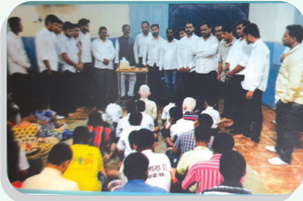
Donation to Blind School