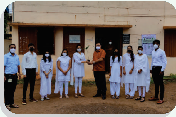
Visit to Morewadi Gram Panchayat