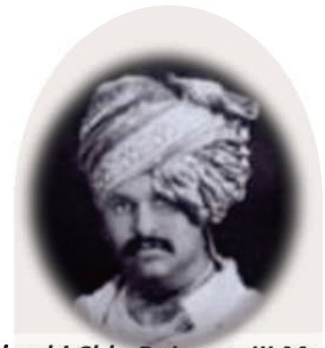
Rajarshi Chh. Rajaram III Maharaj