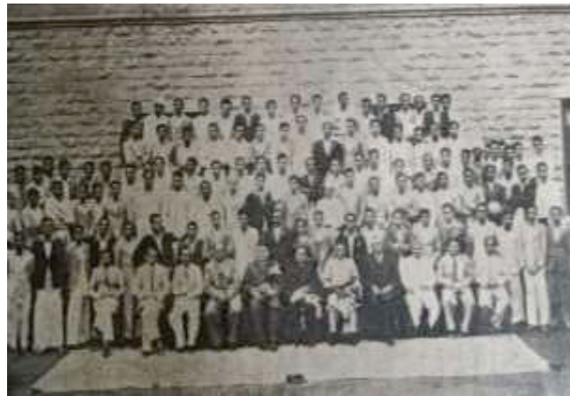
Annual Social, 1943-44