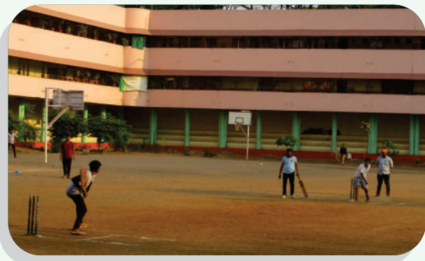
Annual Sport Day