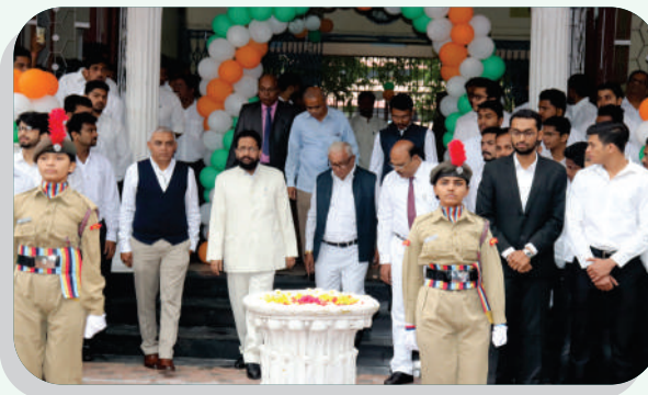
Republic day 2019