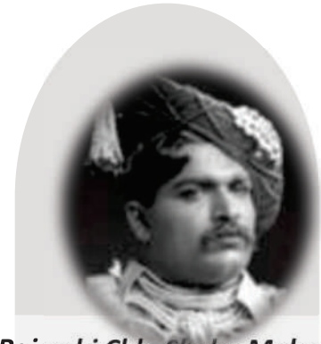
Rajarshi Chh. Shahu Maharaj

Following in his father's footsteps, Chh. Rajaram Maharaj III paved the way for provision of free primary education as well as extending education to women. Amongst many of his contributions to the society of Kolhapur, like the establishment of the Kolhapur High Court, another instrumental contribution is the establishment of one of the oldest Law Colleges in the present-day State of Maharashtra.