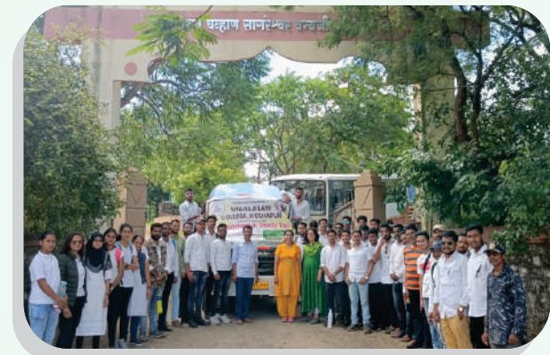
Environmental study tour