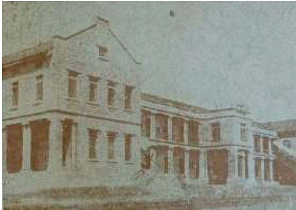
Sykes Law College, 1933