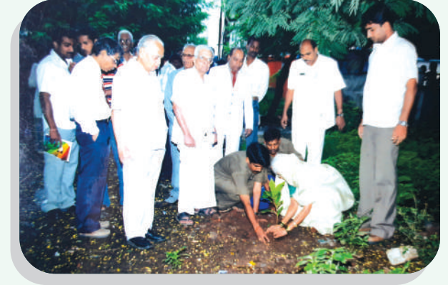
Tree Plantation, 2005