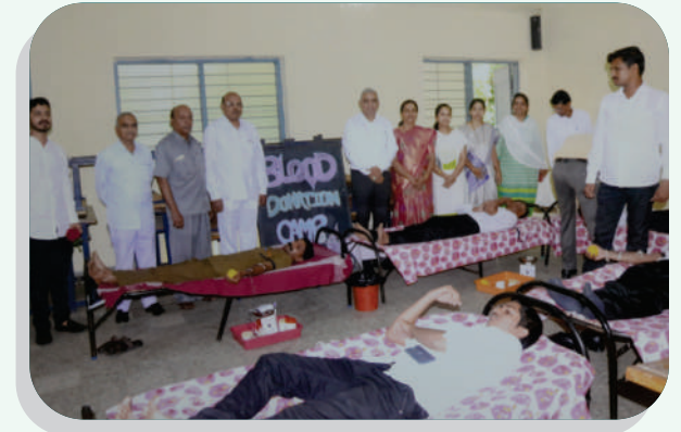
Blood donation camp, 2017