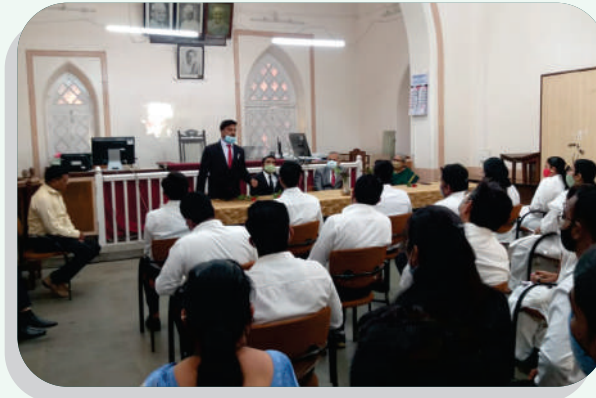
Workshop at Family Court