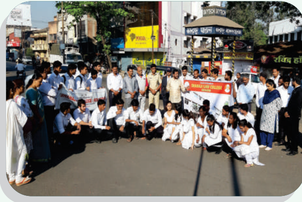
Electoral Literacy Campaign