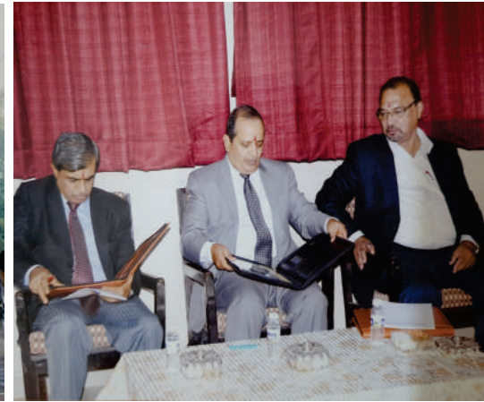
NAAC Peer Team Visit, 2017