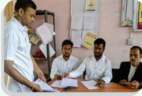
Participation of SLC Students in DLSA Activity