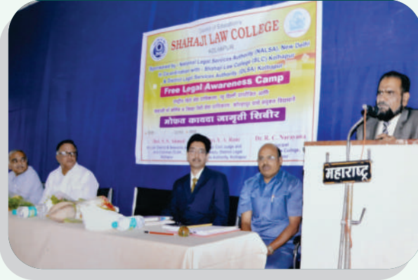
Inauguration of NALSA - sponsored activities, 2014. Justice S. Ahmed