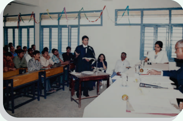
Moot Court, 2005-06