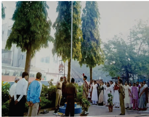
Republic Day, 2008