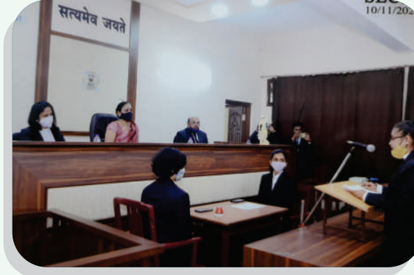
Moot Court in Marathi, 2021