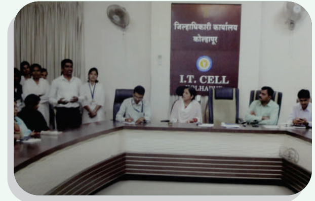
Visit to I.T. Cell, Kolhapur, 2015