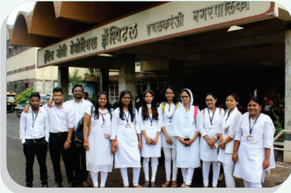
Visit to Ichalkaranji Municipal Hospital