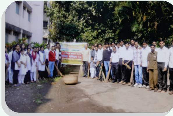
Cleanliness Drive, 2014