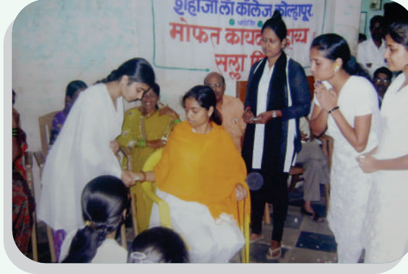
Skit in Free Legal Aid Campaign, 2014